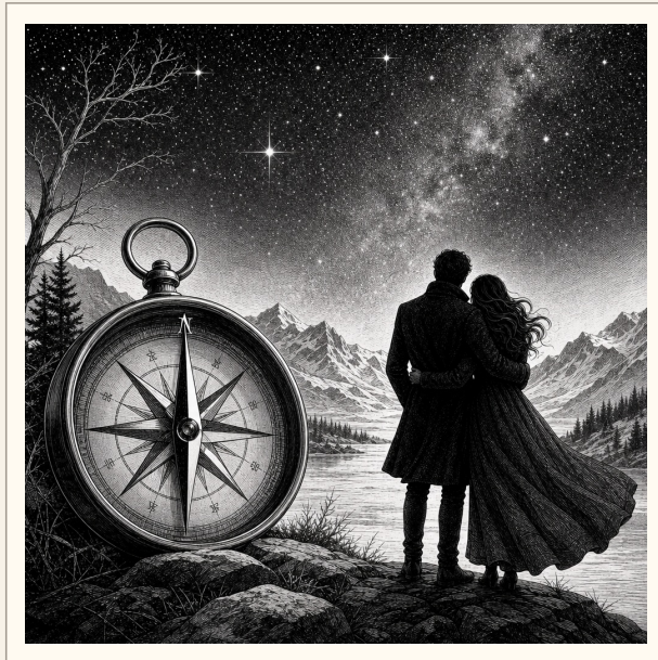
THE STABLE SIGNAL. THE RIGHT DIRECTION.

The North Pole Method by Brandon Fox / copyright Loha Interactive 2026.